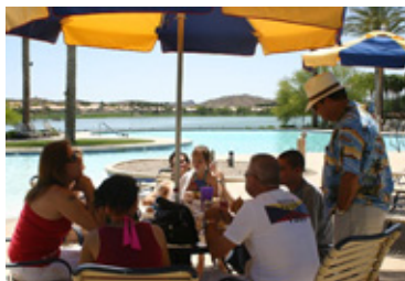
AZ Employees enjoy their lunch.