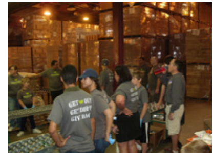
Waiting for the boxes to come down the line