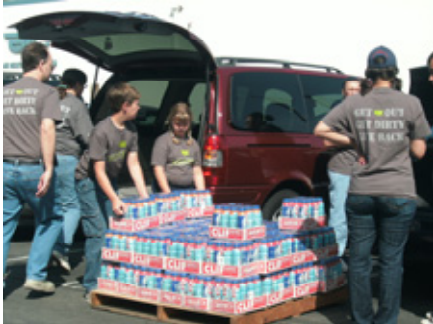
Doidge Family unloads ClifBar donation.

Valasi also coordinated with Clif Bar to donate over 3,000 pounds of food including sports drinks, bars and gel shots to the OC Food Bank. Thank you, Clif Bar!