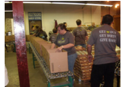
States assembly line.