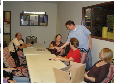
Safety Incentive Program Meetings